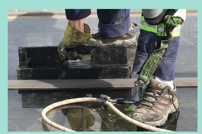
Application of Spectrem 2 sealant on the skylight above the Mayfield Toyota Ice Palace